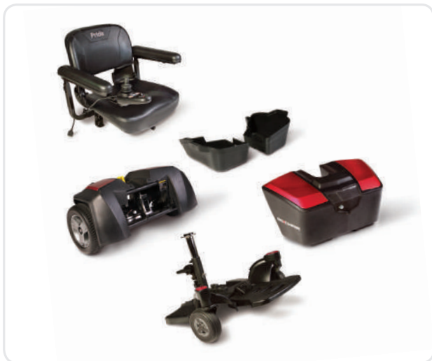
One-hand "Feather Touch" disassembly

The all-new Go Chair® is re-engineered from the ground up, offering a bold style available in an array of contemporary colours. Enhanced performance and comfort, along with feather-touch disassembly, allows you to enjoy lightweight travel and independence on the go. With an increased weight capacity of 136 kgs (300 lbs.) and a sleek, bold look, the Go Chair® makes travel easy.